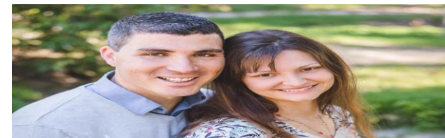
DAVID BOOTH TONIGHT - 6 P.M.

Buy one adult Gray shirt and you will give two children a shirt for free. You must pre-pay the $10.00 when you order the shirts. Please see Jessica Young to order your shirt by June 2nd. You can register your child now and pick their size and color.